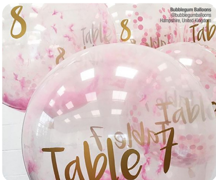
Design elegant centerpieces or cake table backdrops.