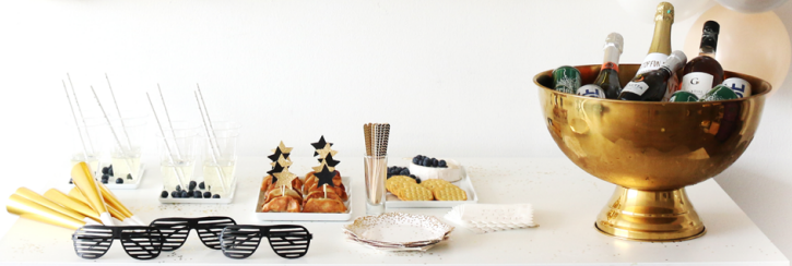
Little Miss Party @littlemissparty New York City, USA