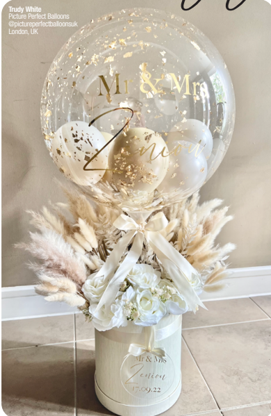
Trudy White Picture Perfect Balloons @pictureperfectballoonsuk London, UK