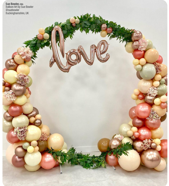
Sue Bowler, csa Balloon Art By Sue Bowler @suebowler Buckinghamshire, UK

A personalised Deco Bubble is a thoughtful and delightful touch for the happy bride and groom to be!