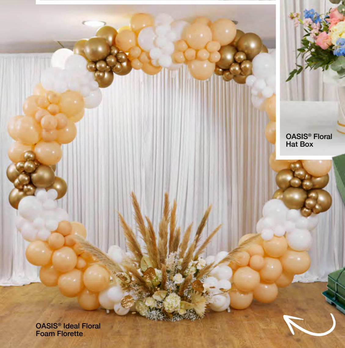
OASIS® Ideal Floral Foam Florette