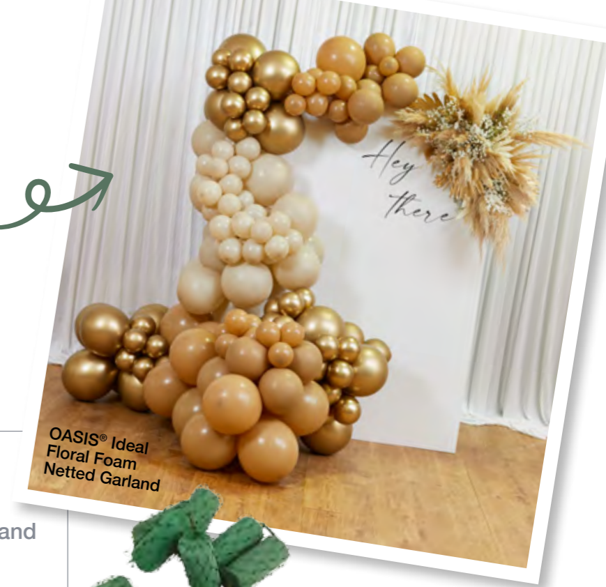
OASIS® Ideal Floral Foam Netted Garland