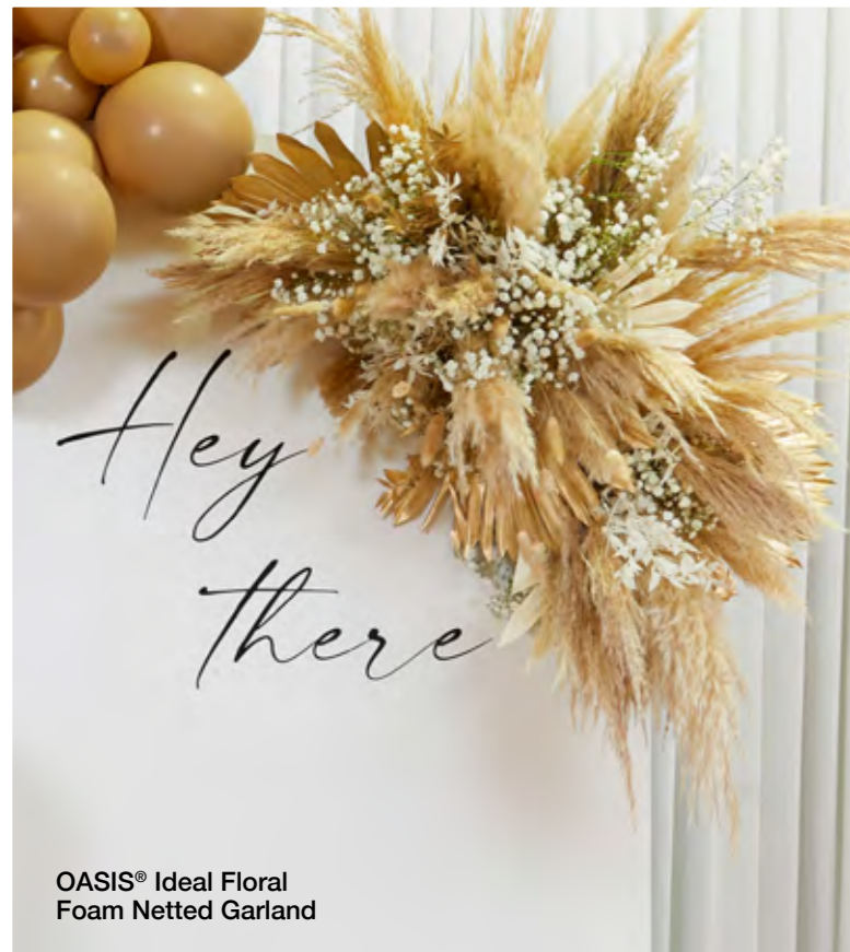
OASIS® Ideal Floral Foam Netted Garland