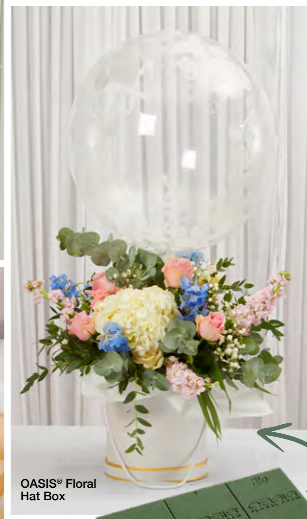
OASIS® Floral Hat Box